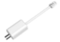
LR1002 ePoE Over Coax Converter